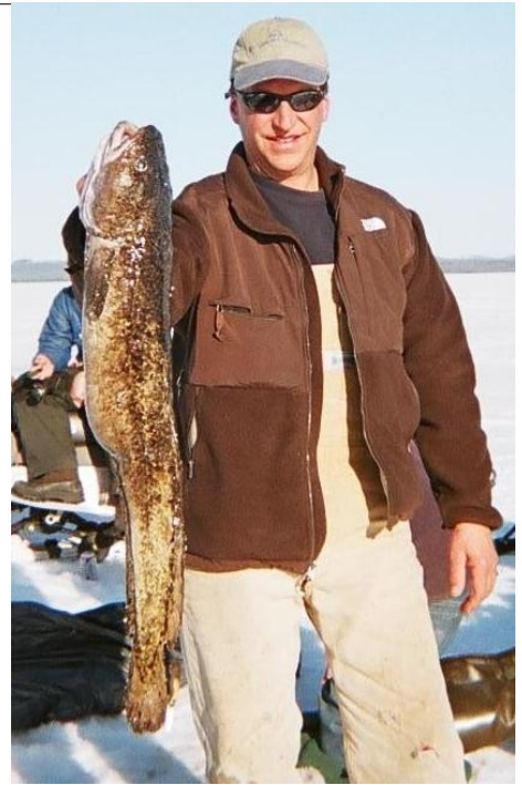
Common Name: Cusk. Other Names: Burbot, Lawyer Fish (Great Lake states), Freshwater Cod. Scientific Name: Lota Iota. Origin: Native

"I AM" is an utterly engaging and entertaining non-fiction film that poses two practical and provocative questions: what's wrong with our world, and what we can do to make it better? The filmmaker behind the inquiry is Tom Shadyac, one of Hollywood's